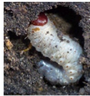
Red-headed cockchafer larva, Adoryphorus couloni . These also feed on live roots and can become a pest in pastures and lawns

Insects are great dispersers and will quickly locate changing resources and establish breeding populations in gardens and more extended areas that are being managed as natural functioning ecosystems, following the principles described here.