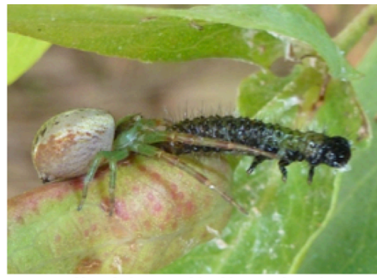
Leaf beetle larva grabbed by a crab spider

Predatory insects , such as solitary wasps, nest in holes that they provision with prey for their larvae, such as caterpillars and spiders. Some excavate vertical tunnels in the ground, such as spider wasps, whereas other utilise existing horizontal holes and crevices in timber. Nesting places can be augmented by retaining open sandy areas of ground and by drilling horizontal holes of different sizes in untreated wooden posts and dead tree trunks and in clay-filled blocks.