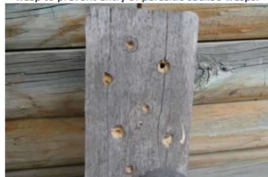
Exited holes previously occupied by nests of the mason wasp, Pison sp., in a block of wood. These vacated holes need to be cleaned out for reuse.

Other hole nesters. The majority of solitary bees nest in holes in the ground but some such as the resin and leafcutter bees, ( Megachile spp., shown here) and masked bees ( Hylaeus sp.) also nest in pre-existing holes in timber and other crevices and will make use of artificial holes.