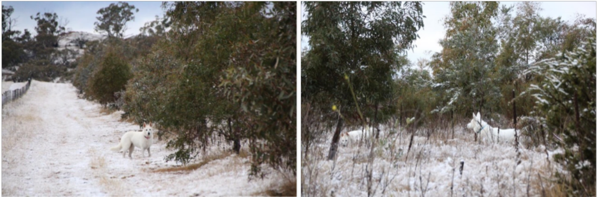
The wonderful growth at our tree plantings is enjoyed by all.

“They certainly have grown well. I reckon some of them are up to five metres,” I reply. This was not too surprising since we had perhaps extravagantly, put in automatic irrigation using dripper lines prior to planting.