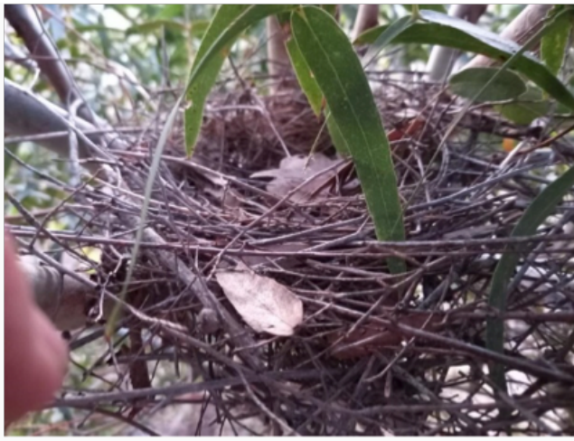
The nest hiding in our plantings

“I hope they come back next Spring,” I say with a heart-felt smile in my voice. “What sort of birds do you think they are?”