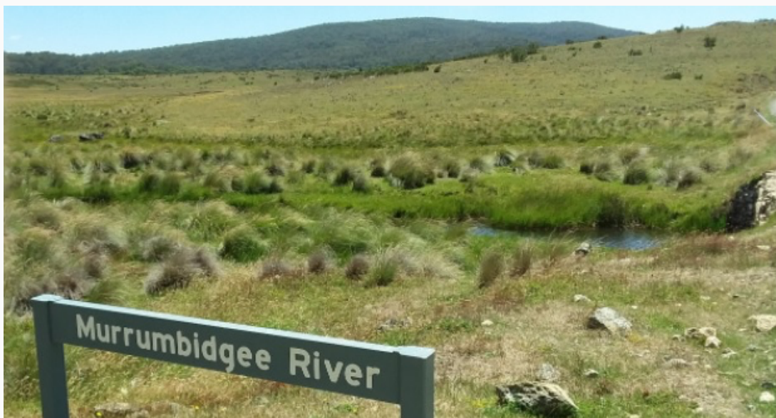
The Murrumbidgee River on Long Plain in Kosciuszko National Park

The forum heard that current flow management arrangements allow 96% of headwater flows to be extracted at Tantangara Dam, as part of the Snowy Hydro Scheme. As a result, the flows in the upper Murrumbidgee are well below the scientifically accepted level required to maintain a healthy river ecosystem. Monitoring data presented at the forum showed how parts of the river ran dry during the 2019/2020 Black Summer with critical water shortages and algal blooms experienced by local communities. Concerns were raised that in the future such events could also impact native fish.