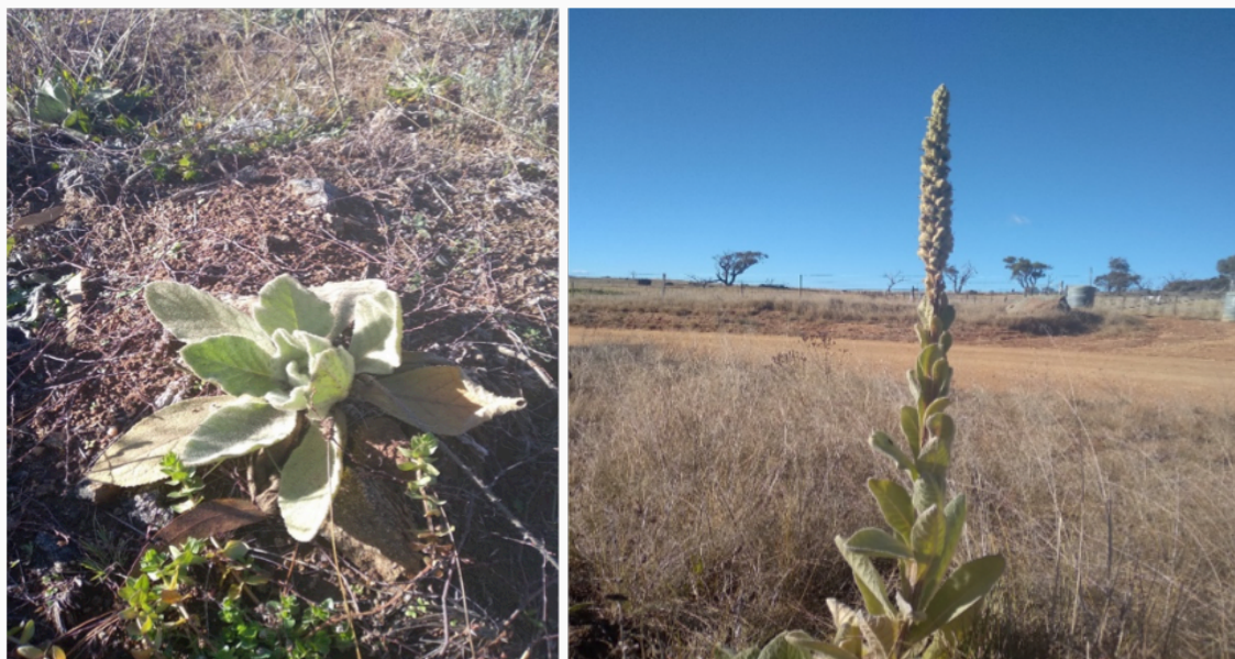
Verbascum thapsus rosette and flower stem

In its first year it forms a large rosette with grey/green leaves covered in layers of hairs giving it a woolly appearance making it an easily identifiable plant. In its second year, a single flower stem with numerous yellow flowers appear in late Summer. Although the plant dies once the seeds set, each plant can produce 250,00 seeds and 80% of these seeds are expected to germinate. What is even more distressing is that the seeds can remain viable in the ground for up to 100 years.