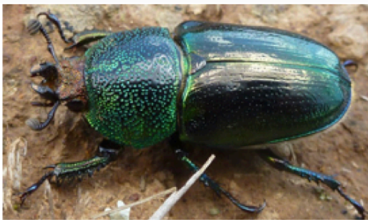
Female 'golden' stag beetle, Lamprima aurata . Its larva feeds on rotting wood

Decomposers. Ecosystems cannot function without the recycling of nutrients from the breakdown of organic matter, derived from the shedding of leaves and bark, and from entire fallen trees as well as from decaying roots. Beetle and moth larvae, cockroaches and termites are involved in this process and the adults of some of these species are quite spectacular in appearance. Household organic matter can also be recycled by insects as much as by earthworms.