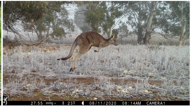
Some of the wildlife pictured during the control period

This project was supported through the South East Local Land Services Managing Established Pest Animals and Weeds Project and South East Bushfire Recovery Funding.