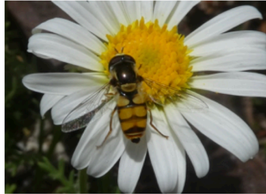
Hoverfly, Simosyrphus grandicollis , feeding on pollen on a Brachyscome daisy

Decomposers. Ecosystems cannot function without the recycling of nutrients from the breakdown of organic matter, derived from the shedding of leaves and bark, and from entire fallen trees as well as from decaying roots. Beetle and moth larvae, cockroaches and termites are involved in this process and the adults of some of these species are quite spectacular in appearance. Household organic matter can also be recycled by insects as much as by earthworms.