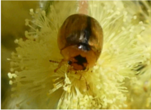
A leaf beetle, Peltoschema sp. feeding on acacia pollen. Small beetles are the main pollinators of Acacias.

mate, such as soldier beetles. Establishing a garden with a range of different types of native flowering plants, so that nectar and pollen are available throughout the year, will attract and sustain a wide range of insect species.