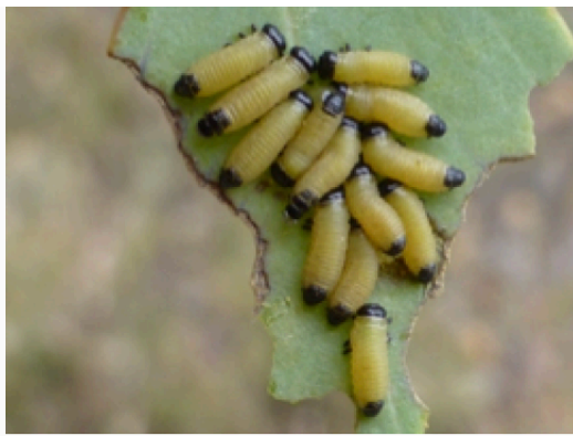
Leaf beetle larvae, Paropsis atomaria , feeding on a gum leaf