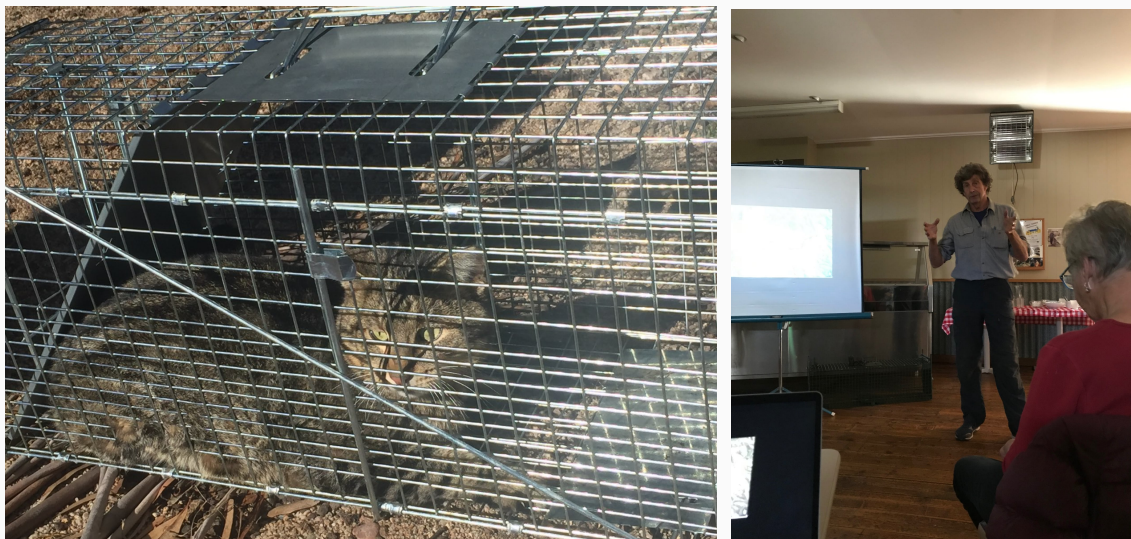
One of the 8 feral cats & Numeralla chair Jim Wharton at the community information session

Pest control was undertaken along 25km firescar boundary and adjacent properties. A cat-detection dog was used to survey the area to help identify trap positions. Qualified trappers were contracted to remove vertebrate pests using a combination of soft jaw and cage traps. Two trapping sessions were undertaken, each over 20 days and were conducted three months apart. Trail cameras were also used to monitor pest presence and abundance, as well as other species in the area. Any feral cat or fox that was caught was sampled to conduct dietary analysis to identify any prey animals. In conjunction with CSIRO, samples were also collected to test for RHDV antibodies.