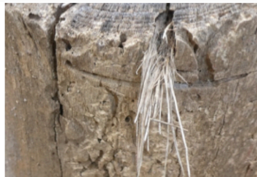
Digger wasp nest, Isodontia sp. occupying a crevice in a tree trunk. The grass stems are inserted by the wasp to prevent entry of parasitic cuckoo wasps.