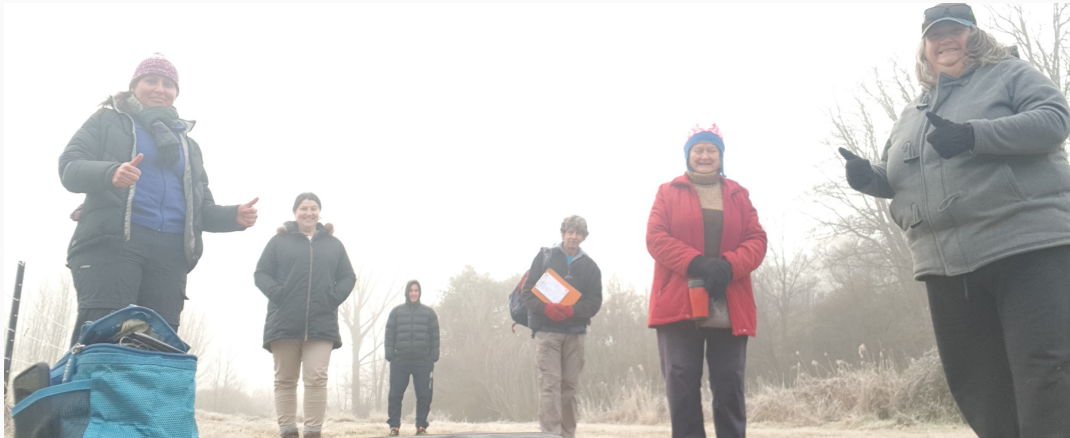
Intrepid volunteers braving the cold at a socially distant early morning platypus survey on the Cooma Creek