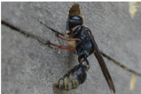
Mud wasp Pison sp. (Crabonidae) inspecting an artificial nest hole

Predatory insects , such as solitary wasps, nest in holes that they provision with prey for their larvae, such as caterpillars and spiders. Some excavate vertical tunnels in the ground, such as spider wasps, whereas other utilise existing horizontal holes and crevices in timber. Nesting places can be augmented by retaining open sandy areas of ground and by drilling horizontal holes of different sizes in untreated wooden posts and dead tree trunks and in clay-filled blocks.