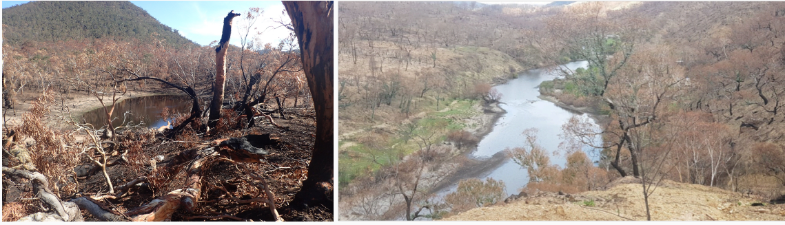
The state of the Numeralla area post bushfire

Pest control was undertaken along 25km firescar boundary and adjacent properties. A cat-detection dog was used to survey the area to help identify trap positions. Qualified trappers were contracted to remove vertebrate pests using a combination of soft jaw and cage traps. Two trapping sessions were undertaken, each over 20 days and were conducted three months apart. Trail cameras were also used to monitor pest presence and abundance, as well as other species in the area. Any feral cat or fox that was caught was sampled to conduct dietary analysis to identify any prey animals. In conjunction with CSIRO, samples were also collected to test for RHDV antibodies.