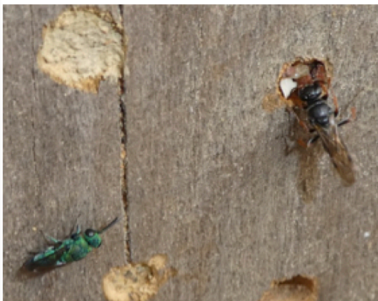
Resin bee, Megachile sp., at nesting hole with cuckoo wasp, Chrysis sp., waiting to parasitise the nest.